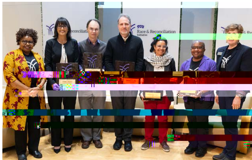
2024 Plume Award Winners

b'5df]zFF =\cghYX hY zci fH 'Ubbi U' FYWc bW]U]h]cb 8UmUh hY '6fck b! @ drc b i b] Yfg]m] i b]cb'5i X]hc f]i a "H\Y \ ]gfc f]W' fYdcfhzcW gYX' cb ]fYW'bhVi hFY'UhYX' < ]gfc f]YgZ% - , hc' &$&$", H\Y_YmhYa Yg hUhYa Yf[ YX Zca 'hY' fYgYUfW' ]bW' XY' YUXYfg\ ]dZgri XYbh]bj c j Ya YbhZ